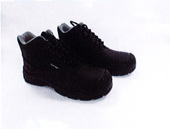
Footwear described as Rhodium RF250